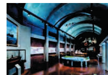
Verkehr Museum Special Exhibit: Seikenji Temple & the Korean Delegations