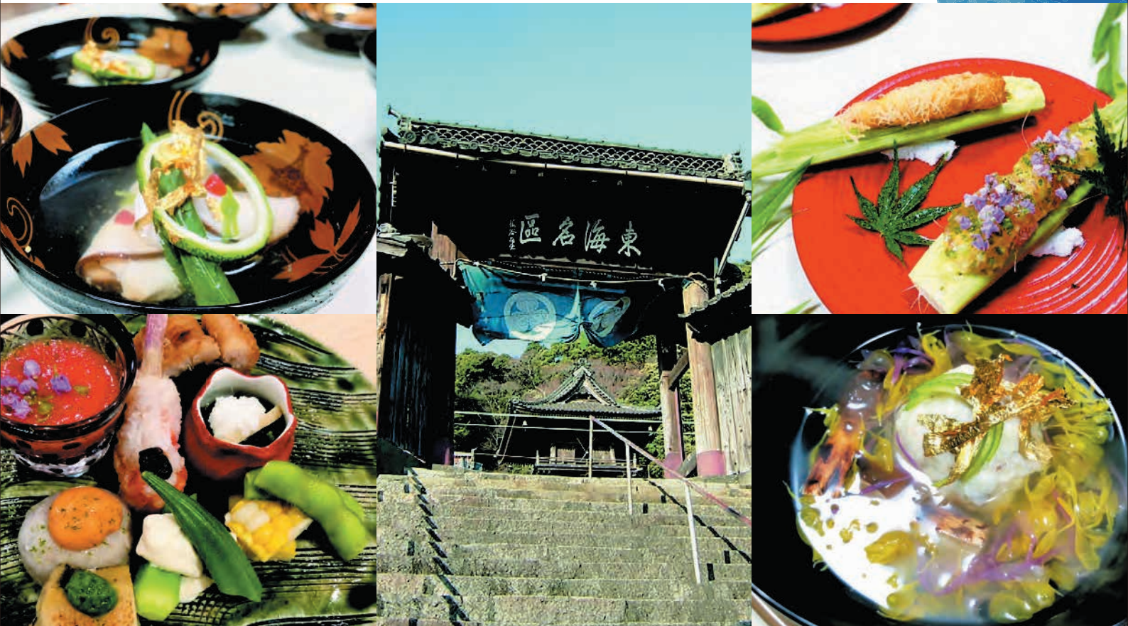
Photos are for illustrative purposes only. Actual dishes may vary.

A partial recreation of the feasts offered to historical delegations from Korea, made with local Okitsu ingredients