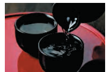
Garyubai Junmai Ginjo sake with a connection to Tokugawa Ieyasu